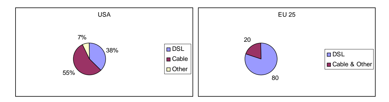
Figure 1. DSL and cable markets shares in the United States and the EU

In the case of fibre local access networks, comparison is often made with the United States where regulated access to new fibre investment by telecommunications operators is the exception. In this connection, it is worth pointing out the differences between the EU and the USA. In the United States, relatively few subscribers use xDSL (Digital Subscriber Line) technology due to the length of the copper loops, so the telecommunication companies are the minority player in the broadband market, which is dominated by cable (TV) companies - the opposite of the situation in Europe (see Figure 1).